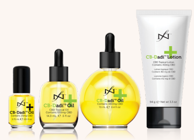
CB-DADI''OIL SIZES: 14.3 mL / .5 fl oz 3.75 mL / .125 fl oz -24 pack (not shown) 72 mL / 2.4 fl oz 14.3 mL / .5 fl oz -12 pack (not shown) CB-DADI'*LOTION SIZES: 94 g / 3.3 oz